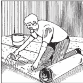
4. Spread the glue