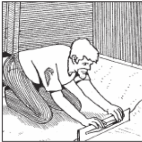
1. Level the sub-floor