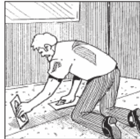
5. Roll using 100 lb. roller & eliminate all air bubbles

NOTE: Product, adhesive and floor must be at 68° Fahrenheit for 48 hours before installation. Clean all excess glue when wet. Keep all traffic off for 48 hours. Inspect rolls BEFORE installation. Do NOT install material with visual defects