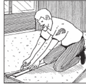
3. Double cut seams