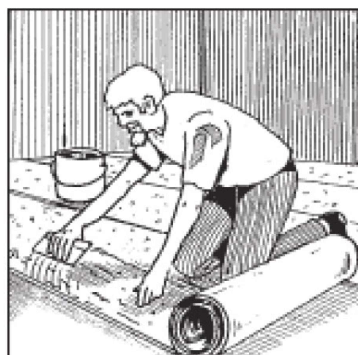
4. Spread the glue