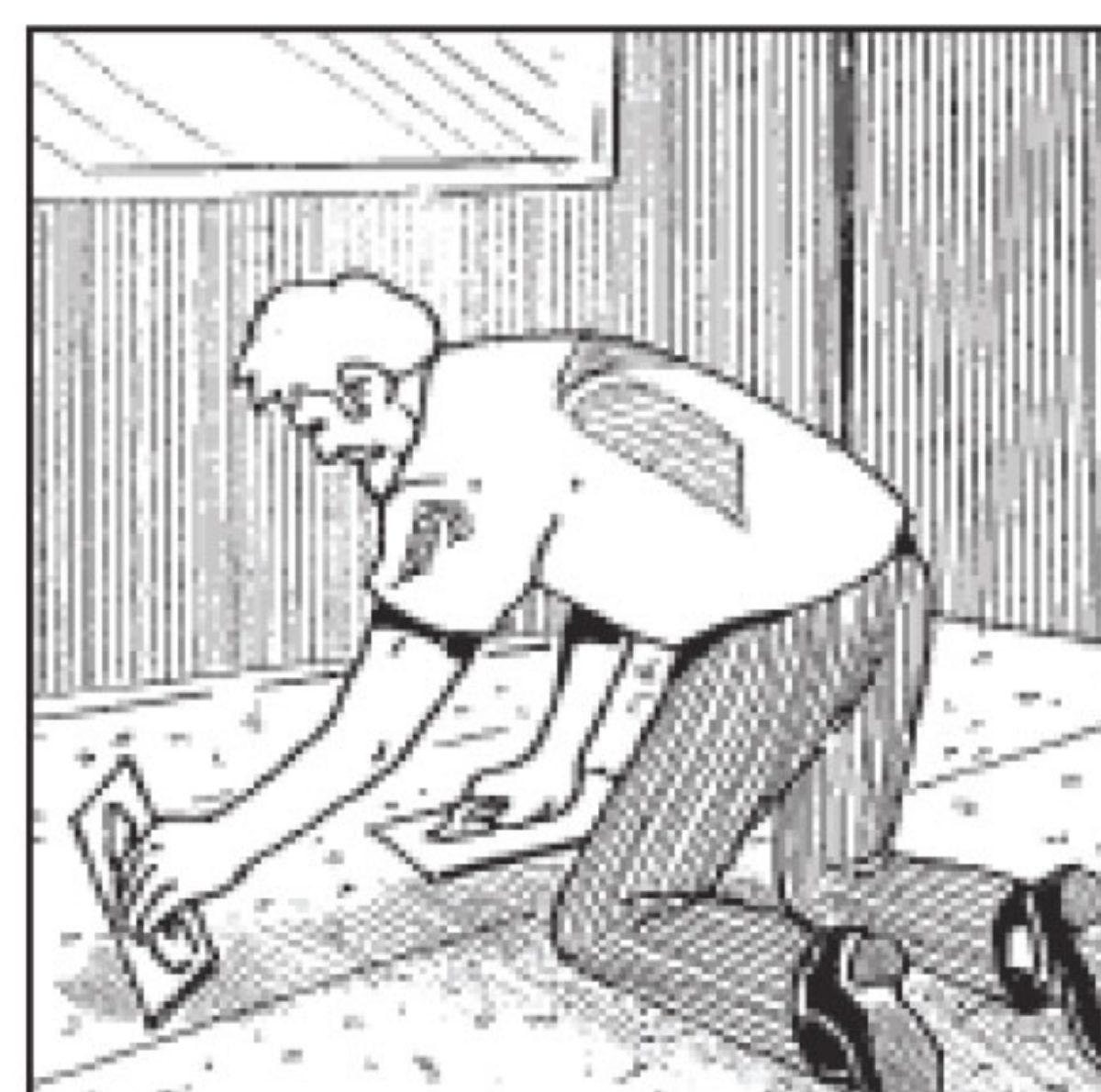
5. Roll using 100 lb. roller & eliminate all air bubbles

NOTE: Product, adhesive and floor must be at 68° Fahrenheit for 48 hours before installation. Clean all excess glue when wet. Keep all traffic off for 48 hours. Inspect rolls BEFORE installation. Do NOT install material with visual defects