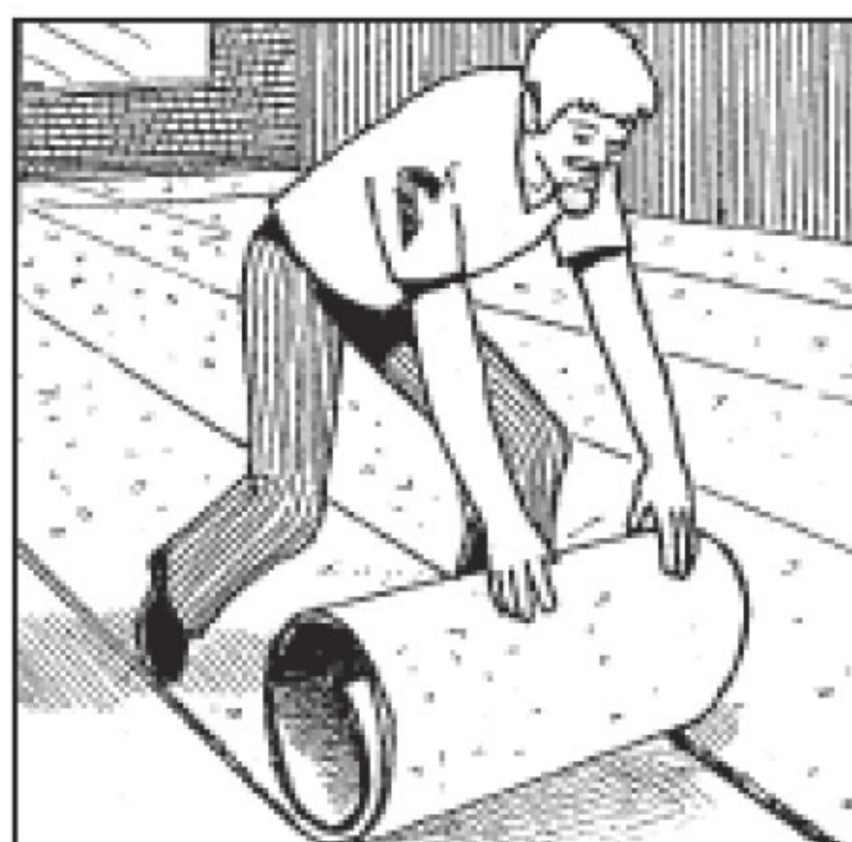
2. Dry lay with overlapped seams