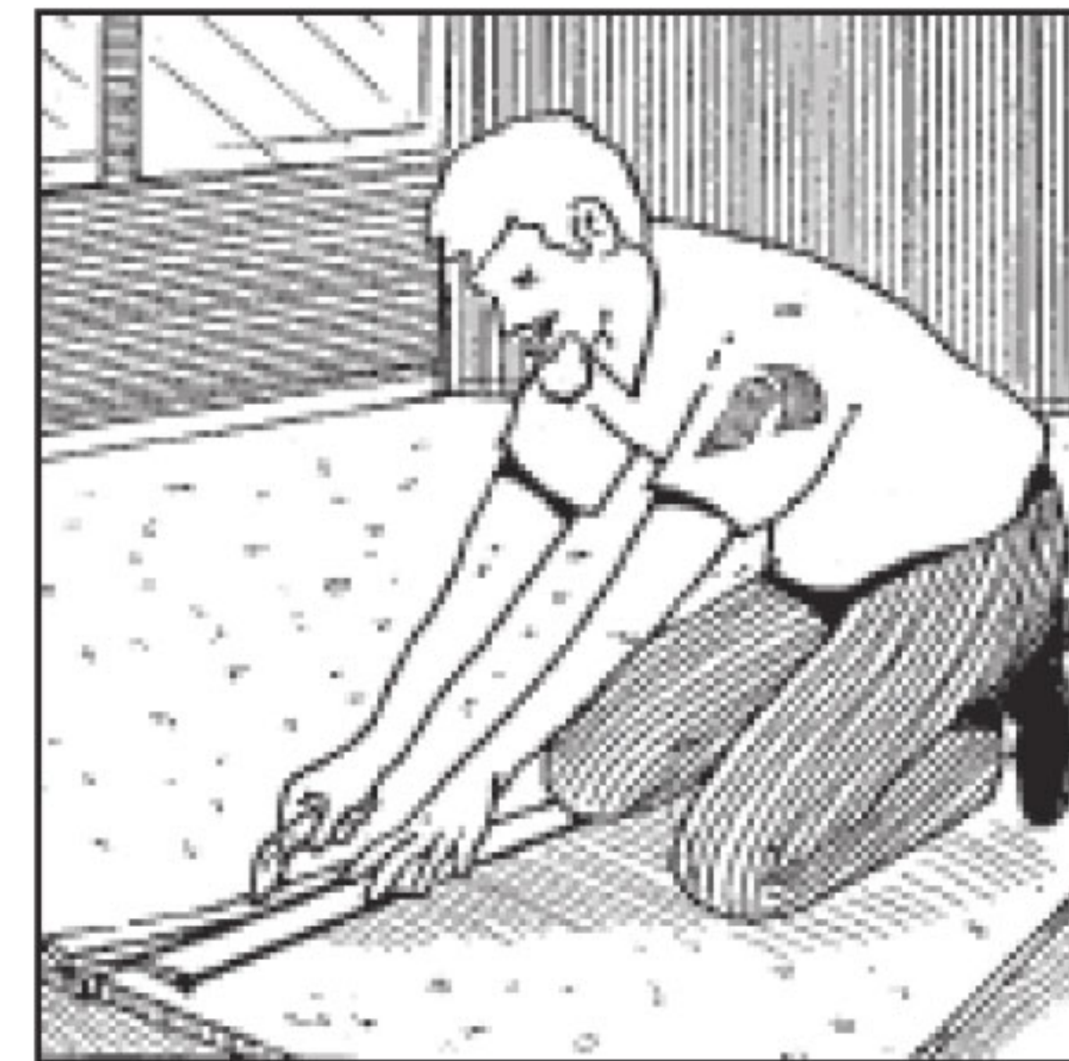
3. Double cut seams